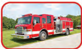
2010 Pierce Impel Pumper Waterous 1500 GPM Pump 750 Gallon Tank Cummins Diesel