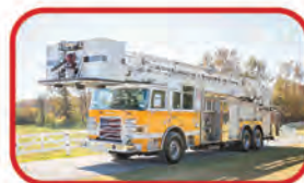
2011 Pierce Arrow XT 100' Platform Waterous 1500 GPM Pump 300 Gallon Tank Detroit Diesel