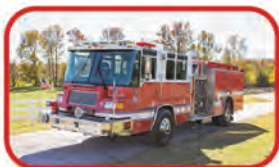
2004 Pierce Quantum Rescue Pumper Hale 1500 GPM Pump 750 Gallon Tank Detroit Diesel