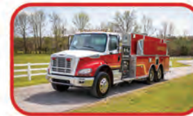
2007 American LaFrance Freightliner Tanker Hale 500 GPM Pump 2500 Gallon Tank Low Miles