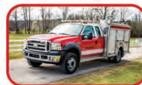
2006 Ford F-550 Light Rescue Pump Diesel Engine