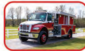
2006 American LaFrance Freightliner Tanker 500 GPM Pump 2000 Gallon Tank Low Miles