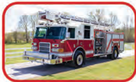
2006 Pierce Enforcer 55' Skyboom Pierce 2000 GPM Pump 500 Gallon Tank Cummins Diesel