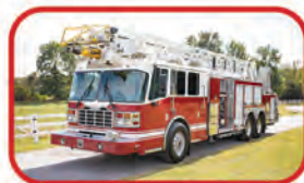
2008 Ferrara Inferno 107' Aerial Waterous 1500 GPM Pump 300 Gallon Tank Low Miles