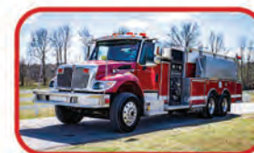
2005 4 Guys International Pumper Tanker Hale 1000 GPM Pump 2000 Gallon Tank Low Miles