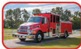
2006 Custom Fire Sterling Pumper Waterous 1250 GPM Pump 500 Gallon Tank Low Miles