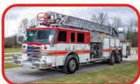
2006 Pierce Dash 75' Quint Waterous 1500 GPM Pump 420 Gallon Tank Detroit Diesel