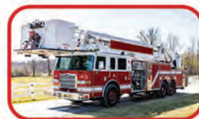
2006 Pierce Dash 100' Platform Hale 2000 GPM Pump 300 Gallon Tank Detroit Diesel