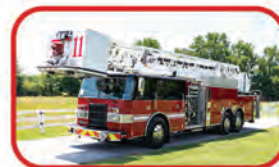
2000 Pierce Dash 85' Platform Waterous 2000 GPM Pump 300 Gallon Tank Detroit Diesel