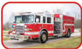
2006 Pierce Dash Rescue Pumper Waterous 2000 GPM Pump 1000 Gallon Tank Caterpillar Diesel