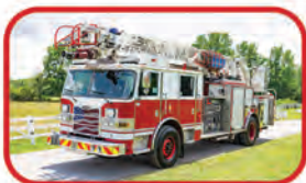
2009 Pierce Arrow 75' Quint Waterous 2000 GPM Pump 470 Gallon Tank Detroit Diesel