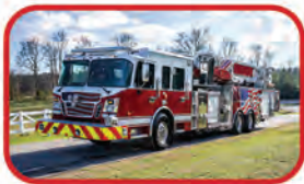
2011 Crimson Spartan 100' Platform Hale 2000 GPM Pump 300 Gallon Tank Low Miles