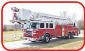
2006 Pierce Dash 100' Platform Detroit Diesel