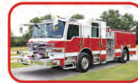
2009 Pierce Velocity Pumper Pierce 1500 GPM Pump 500 Gallon Tank Cummins Diesel