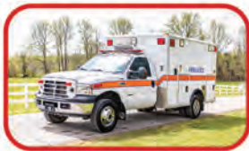
2006 Wheeled Coach Ford 4x4 Ambulance Low Miles