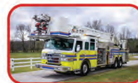
2008 Pierce Velocity 100' Platform Hale 2250 GPM Pump Detroit Diesel