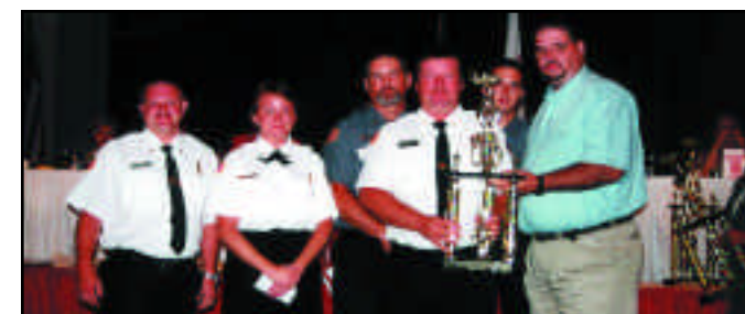
(left) Third Place Overall – Johnsons Crossing Volunteer Fire Department, Cullman County.