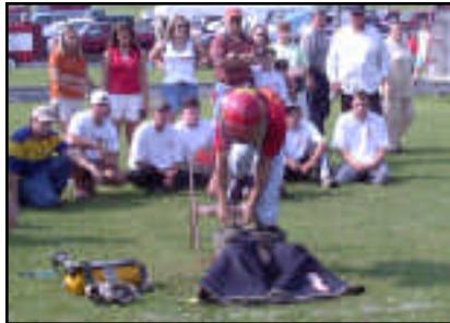
Air Pack Relay