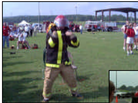
(above) Air Pack Relay