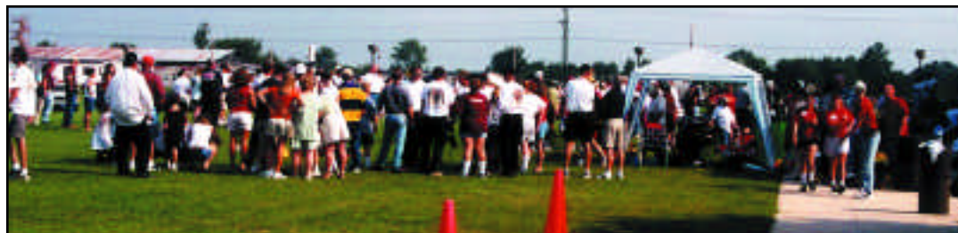
The firefighter's annual competition draws a big crowd.