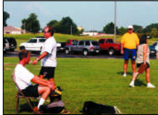
Waiting for the signal! – Air Pack Relay