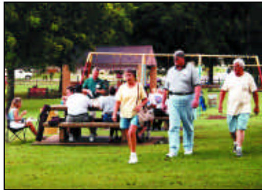
Crowd enjoys Friday night cookout in the park.