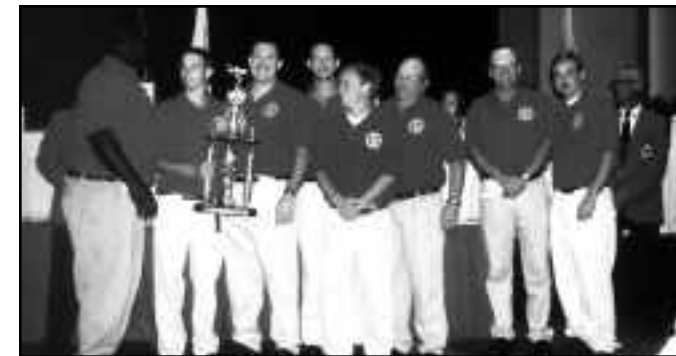
2nd Place Overall – Kinsey Volunteer Fire Department, Houston County