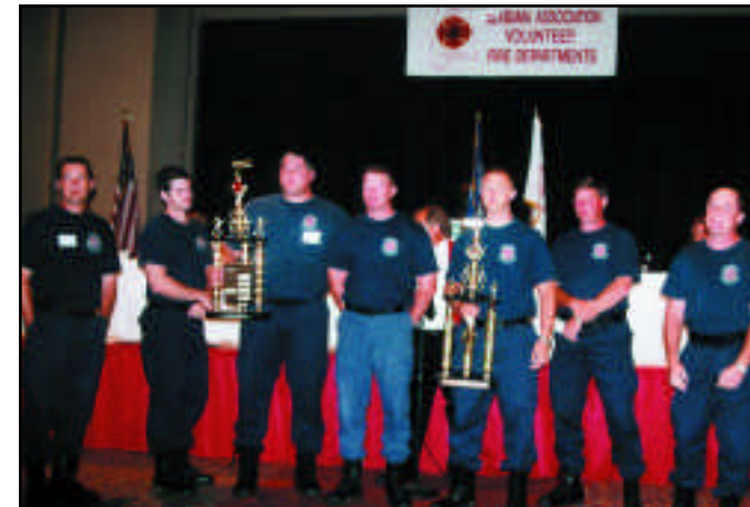
First Place Overall – Thomasville Volunteer Fire Department, Clarke County.